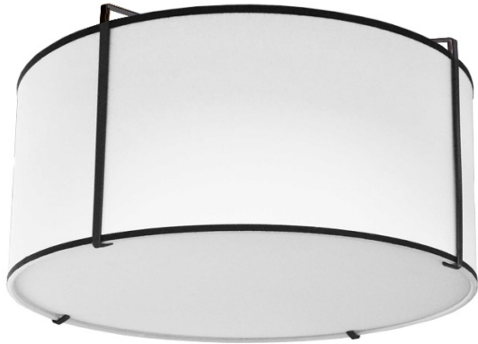
2 Light Flush Mount Drum Black Shade w/ White Fabric Diffuser